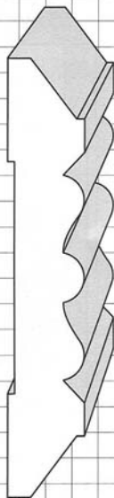
A43 3/4" X 4-1/4"